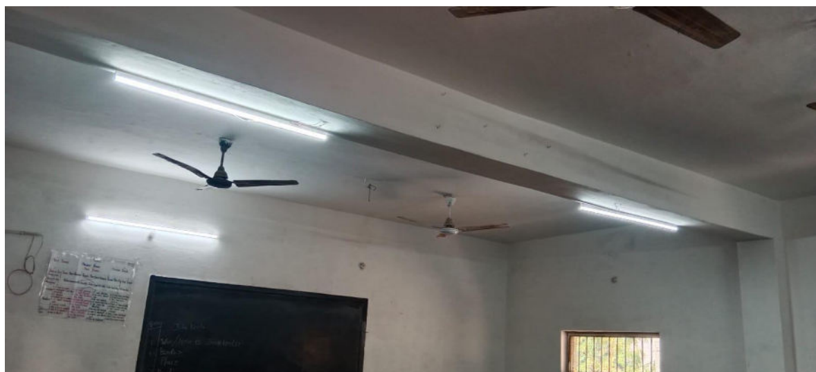
LED lights in College

For efficient energy consumption and saving on electric bill, College has initiated the process of replacing incandescent bulbs and tube lights with LEDs.