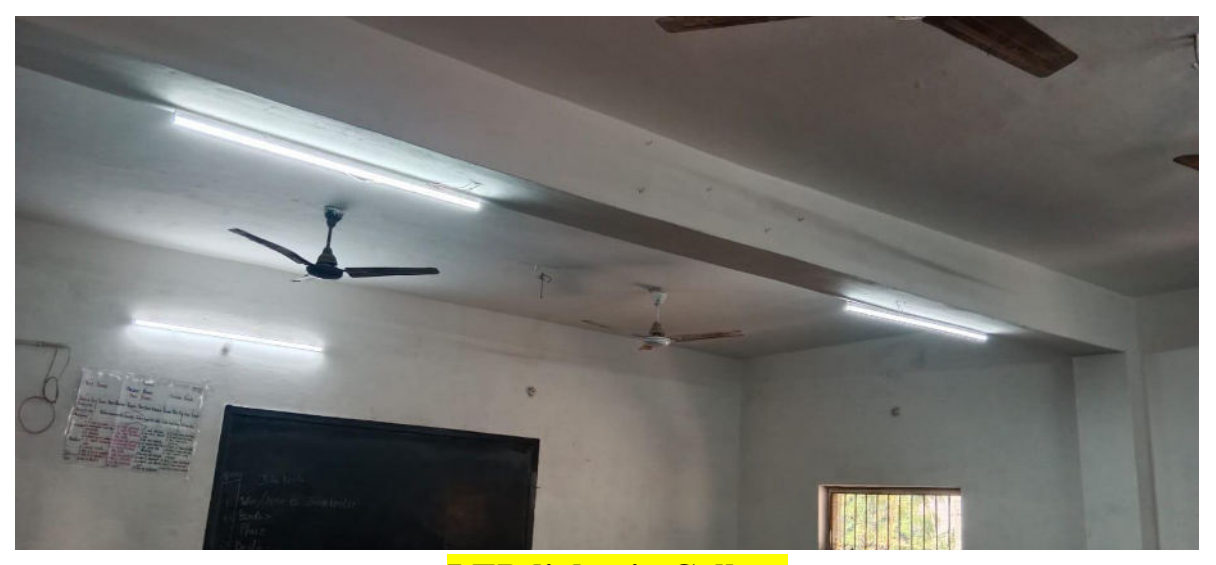
LED lights in College

For efficient energy consumption and saving on electric bill, College has initiated the process of replacing incandescent bulbs and tube lights with LEDs.